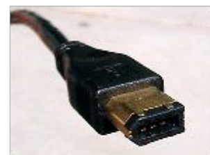
Fire Wire / IEEE 1394